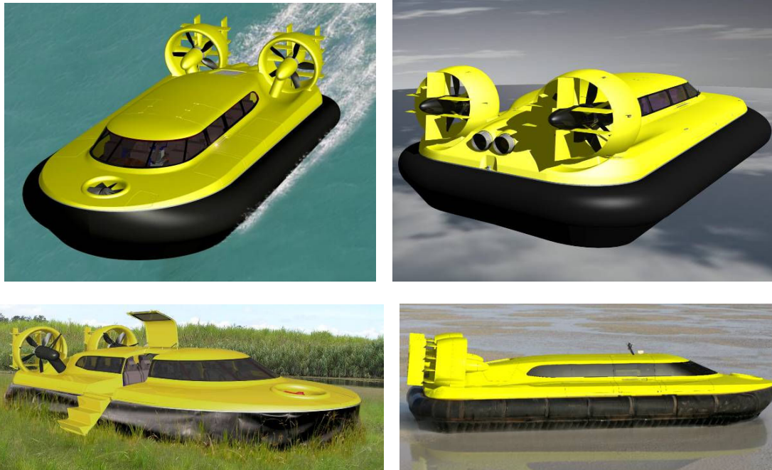
Computer generated images representing the general appearance.

There are four lifting attachment points protruding from the deck upper surface enabling connection with cranes and other lifting tackle. A portable gantry is optionally available.